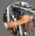
LAUNDRY LOVE Sweetwater, Texas