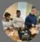
THE SHOP Sweetwater, Texas