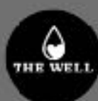
THE WELL PREGNANCY & PARENTING RESOURCES Sweetwater, Texas