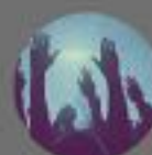
CITY-WIDE REVIVAL Sweetwater, Texas

Missions and outreach are at the very heart of our calling as followers of Christ. We believe that sharing the gospel, meeting needs, and building relationships both locally and globally reflect the love and compassion of Jesus. Our mission is to go beyond the walls of our church to serve those who may never step inside, bringing hope, healing, and the message of salvation to those in need. Through missions, we fulfill Christ's command to "go and make disciples of all nations" (Matthew 28:19).