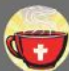
UNDERGROUND COFFEE Lexus undergroundcoffee.org