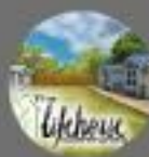
THE LIFEHOUSE COMMUNITY Sweetwater, Texas lifehouse.love