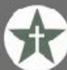
TEXAS BAPTISTS COOPERATIVE PROGRAM texasbaptists.org